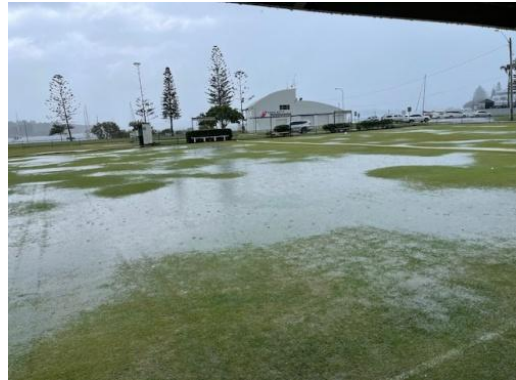
Playing one minute, downpour the next