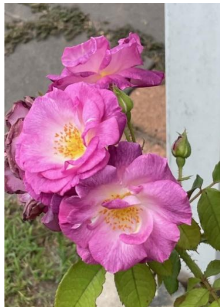
The beautiful 'Blue for You' rose, near the front gate, was donated by Doug Parkinson in 2015.