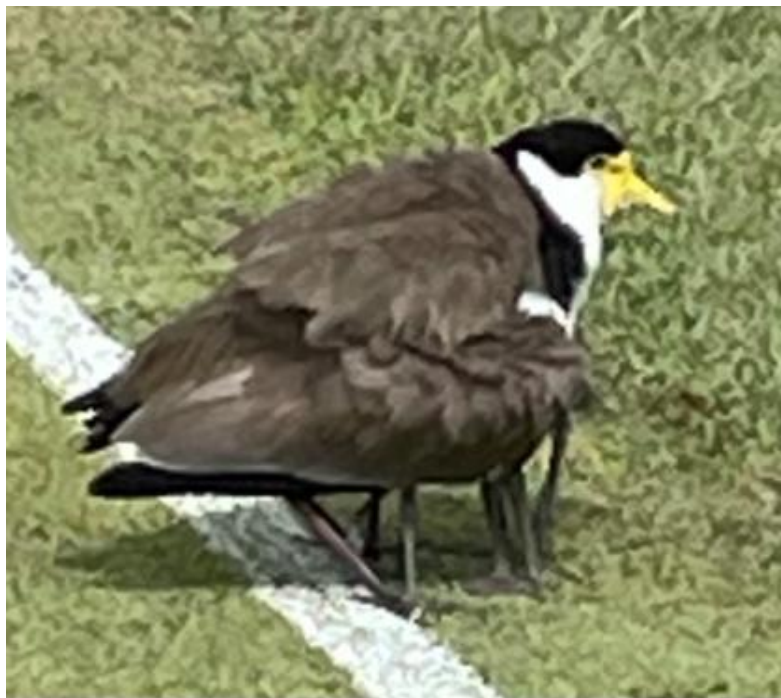
Our resident plover has 3 babies under her wings